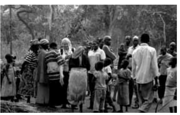
Showing some of the mothers their photos on my camera.

In December 2012, the situation about 40 miles south of here began to 'hot up'. Large numbers of people crossed the border into South Sudan. Things calmed down again and most returned. The Kakwa people live on both sides of the border and there are many marriages and family ties that bind the two communities.