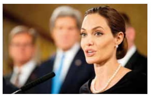
Volume 13, Issue 1 • June 2013

It was a trade-off that finally paid off for Angelina Jolie on 11 April as she stood up before the men in suits and welcomed a deal to tackle rape and sexual violence as weapons of war.