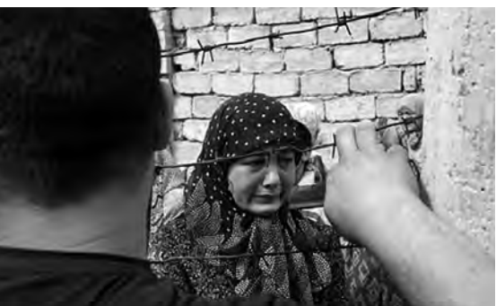
June 2010. Uzbek refugee at the Kyrgyz-Uzbek Border

The authors give the much-abused term "human security" a major makeover starting from the premise that it took General Stanley McChrystal and the US armed forces six years to realise in Afghanistan that ousting even a decidedly abusive government will not succeed without robust and genuine protection of the local population's human rights. . First, human security is about the everyday security of individuals and the communities they live in rather the security of states and borders. It is about the security of Angolans, not the security of Angola. Second it is about not being killed or robbed or forcibly expelled from your home - the sort of insecurity experienced in violent upheavals such as those